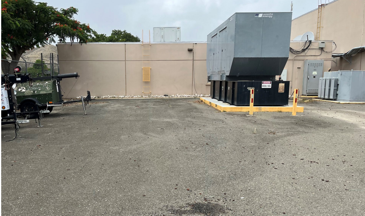
Image 1. Place where the PG#1 will be located. Left side of existing generator from the image view.