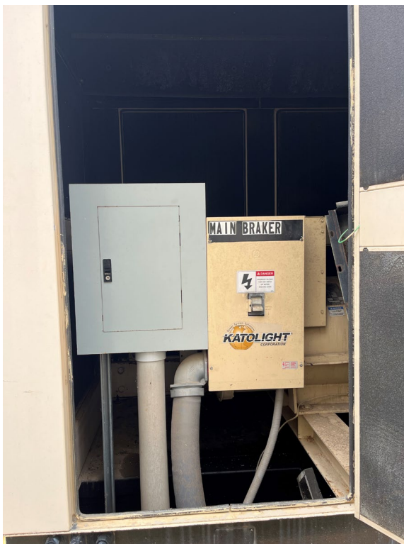
Image 4. Main Breaker of the existing generator, where the PG#2 will connect.