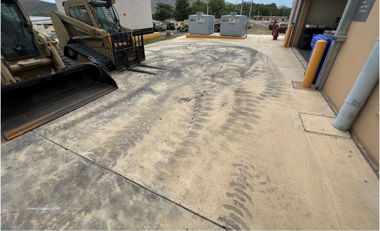
Image 3. Place where the PG#2 will be located. Right side of existing generator from the image view.